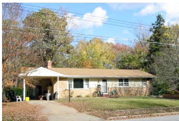
Oxford House-Severna Park 512 Evergreen Street Severna Park, Maryland 21146 9 Men – Tel. 410-975-9238 – Est. June 1998

Where one lived before detoxification or treatment is a good indicator of the severity of addiction. It also is a predictor of sobriety outcome. Homelessness or a rented room can and does quickly lead to resumption of addictive use.