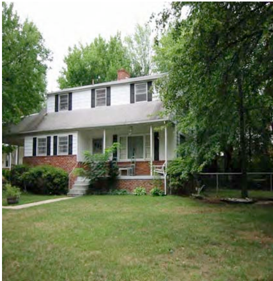
Oxford House-Stoneham Court 6226 Stoneham Court Bethesda, Maryland 20917 Women – Tel. 301-897-9060 – Est. Feb. 1990

During May and June 2004, the residents of 23 of the then 32 Oxford Houses in Maryland answered the standard confidential questionnaire to provide data about the Maryland Oxford House residents. [N 134] The total number of recovery beds for the 32 houses in the state at the time of the survey was 252. 12