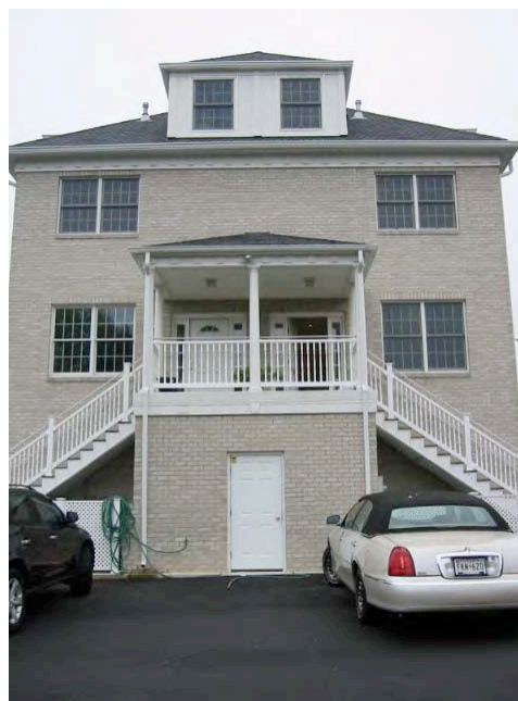
Oxford House-Annapolis 699 Bestgate Road Annapolis, Maryland 12 Men Established Nov. 2004

Expansion of Oxford Houses throughout the State of Maryland is not only feasible but can be assured by using paid outreach workers.