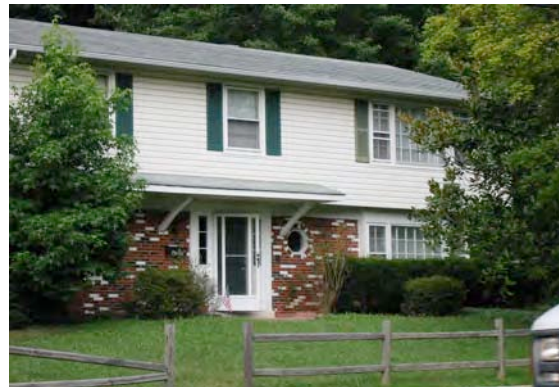
Oxford House-Rock Creek 4305 Bel Pre Road Rockville, Maryland 20853 7 Men – Tel. 301-871-3434 Est. Jun 1996