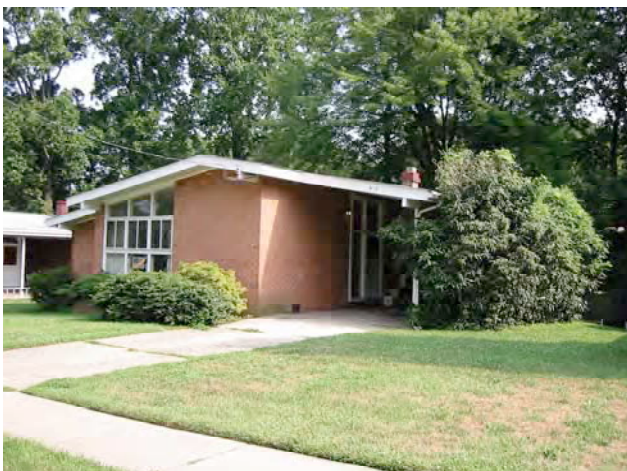
Oxford House-Silver Spring 918 North Belgrade Road Silver Spring, Maryland 20902 7 Women – Tel. 301-754-1865 Est. Feb. 1980

Maryland is the state where Oxford Houses began. In August 1975 the officials in Montgomery County, Maryland decided that to balance the budget it was necessary to close one of the four halfway houses for men in the country. Alpha I, a halfway house with 13 men at 1219 Fidler Lane, Silver Spring, Maryland, was selected to be closed. With the help of a $750 loan from a member of Alcoholics Anonymous, the 13 men in that halfway house rented the building themselves and began the first self-run, self-supported Oxford House. 1