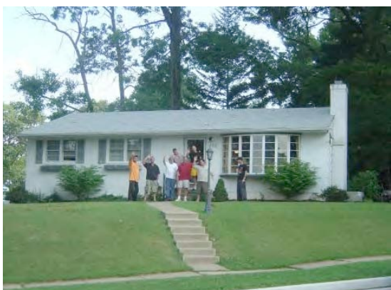
Oxford House-Charloth 115 Charmuth Street Lutherville, MD 21093 7 Men • Established April 1991

the District of Columbia and were directed to purchase costlier commercial insurance policies. The Court held that although insurance policies are not explicitly mentioned in the text of the FFHA, denial of homeowners' insurance on the basis of disability violates §3604(f)(1), which declares it unlawful to "discriminate in the sale, or rental, or otherwise make unavailable or deny, a dwelling to any buyer or renter because of handicap." The court held that denial of insurance coverage would make a dwelling unavailable to the persons with disability and the insurer had to make a reasonable accommodation. Oxford House was a party to the suit. The Wai Case and numerous other disputes with casualty insurance companies settled the fact that insurers of residential housing are subject to the nondiscrimination provisions of both FFHA and ADA.