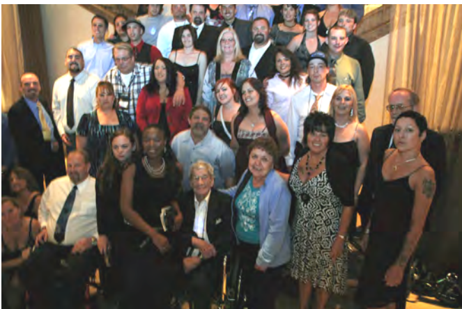
Washington State Delegation