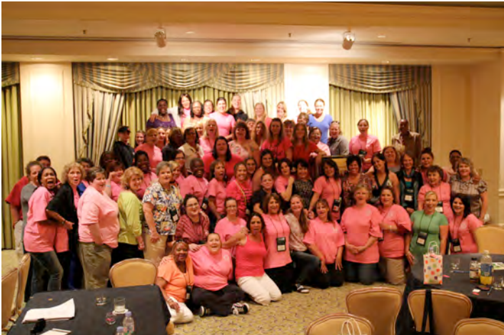
187 Women residents and alumni have a five- hour conference a day before convention.