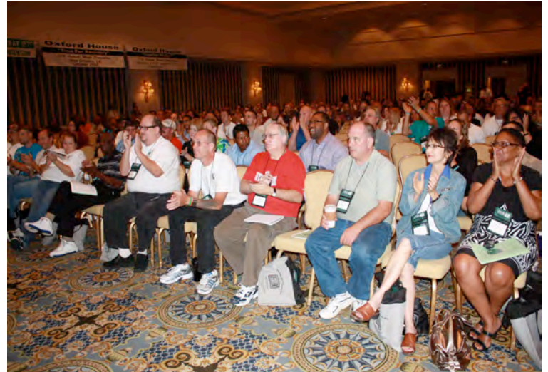
First General Session audience – part of the 710 Convention attendees