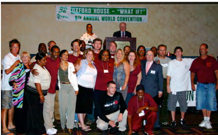
Virginia Oxford House residents at convention getting an award for their voluntary contributions made in 2007 toward expansion