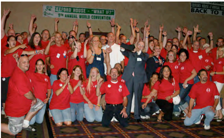
Washington State contributed more than $80,000 to expand Oxford House World Services in 2007

conventions adopted resolutions encouraging voluntary contributions as the best means for assuring that Oxford House residents and alumni control the organization.