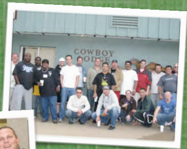
Texas held a workshop and 3-day conference at Wimberly Cowboy resort between Austin and San Antonio. Workshops are a place to teach the right way to operate a house.