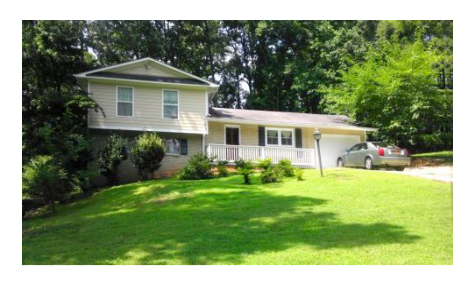
Oxford House – Chisholm Trail is a house for 7 men in Marietta, GA started 9/1/11.

Both houses illustrate how ordinary folks can do extra-ordinary things to help a community to solve problems by working together. Thanks to the employees and management of InComm, Oxford House has the beginning of a statewide network of Oxford Houses in the State of Georgia.