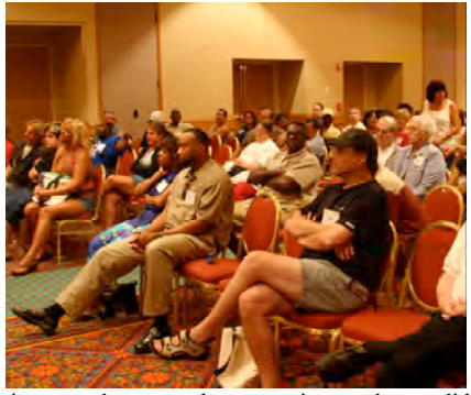
Convention attendees pay close attention as the candidates for Oxford House World Council seek their support.