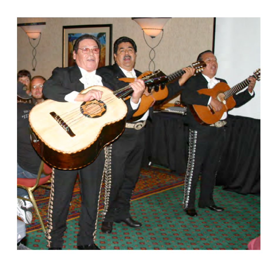
Back to Basics