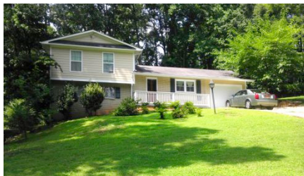
Oxford House – Chisholm Trail is a house for 7 men in Marietta, GA started 9/1/11.

Both houses illustrate how ordinary folks can do extra-ordinary things to help a community to solve problems by working together. Thanks to the employees and management of InComm, Oxford House has the beginning of a statewide network of Oxford Houses in the State of Georgia.