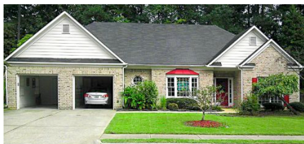
Oxford House—Morgan in Kennesaw, GA is a house for seven women started 10/1/11.

Two houses are up and running in Georgia.